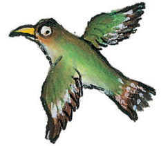
BIRD (already circled)