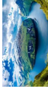
Reception, Summer 1