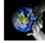
Nursery. Summer 2