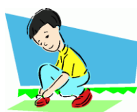
Putting on their own shoes