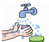
Washing and drying their own hands