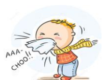
Wiping their own nose.