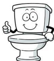
Using the toilet