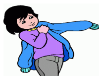
Putting on their own coat